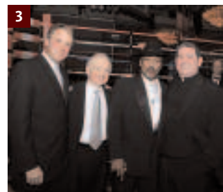
OH, MERCY: Meanwhile, on November 10, Chicago’s trading community traded punches at Ringside for Mercy’s Sake to benefit the city’s Mercy Home for Boys & Girls. 1) Two taut traders spar in the ring; 2) The CME Group was a generous sponsor of the event; 3) Smokin’ Joe Frazier (second from right), the evening’s celebrity judge, with dapper Mercy Home donors and top brass.

PHOTOGRAPHS BY JAMES PETROZZELLO AND JIMMY NICOL (TOP, 1-8); PHOTOGRAPHS BY FLINT CHANEY (BOTTOM, 1-3)