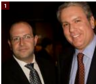
CAPO FOR A CAUSE: Tony “Paulie Walnuts” Sirico mans the phones during BGC Partners’ Charity Day (see “Day Care,” page 28) last September 11. The interdealer broker, spun out of Cantor Fitzgerald, raised some $6 million earmarked for a variety of causes.