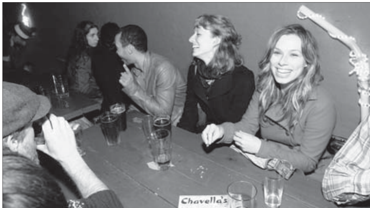
Franklin Park's indoor annex features a working fireplace and serves hot toddies and Irish coffees.

Overlooking Bryant Park's ice skating rink, this two-story lounge boasts great views of the park as well as an outdoor terrace with heated lamps to keep you toasty. The indoor, glass-enclosed space takes on a Canadian theme, best exemplified by The Canadian ($13), a toasty tippie of Canadian whiskey, warm spiced cider, lemon and mint.